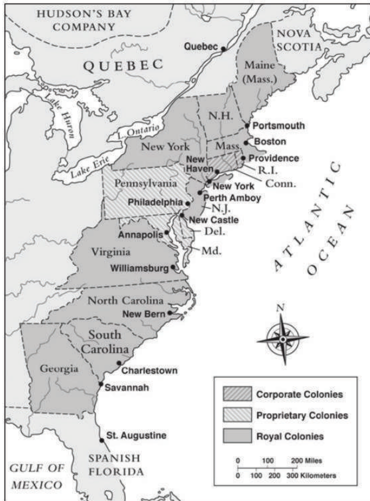
THE THIRTEEN ENGLISH COLONIES AROUND 1750

As a reward for helping him gain the throne, Charles II granted a huge tract of land between Virginia and Spanish Florida to eight nobles, who in 1663 became the lord proprietors of the Carolinas. In 1729, two royal colonies, South Carolina and North Carolina, were formed from the original grant.