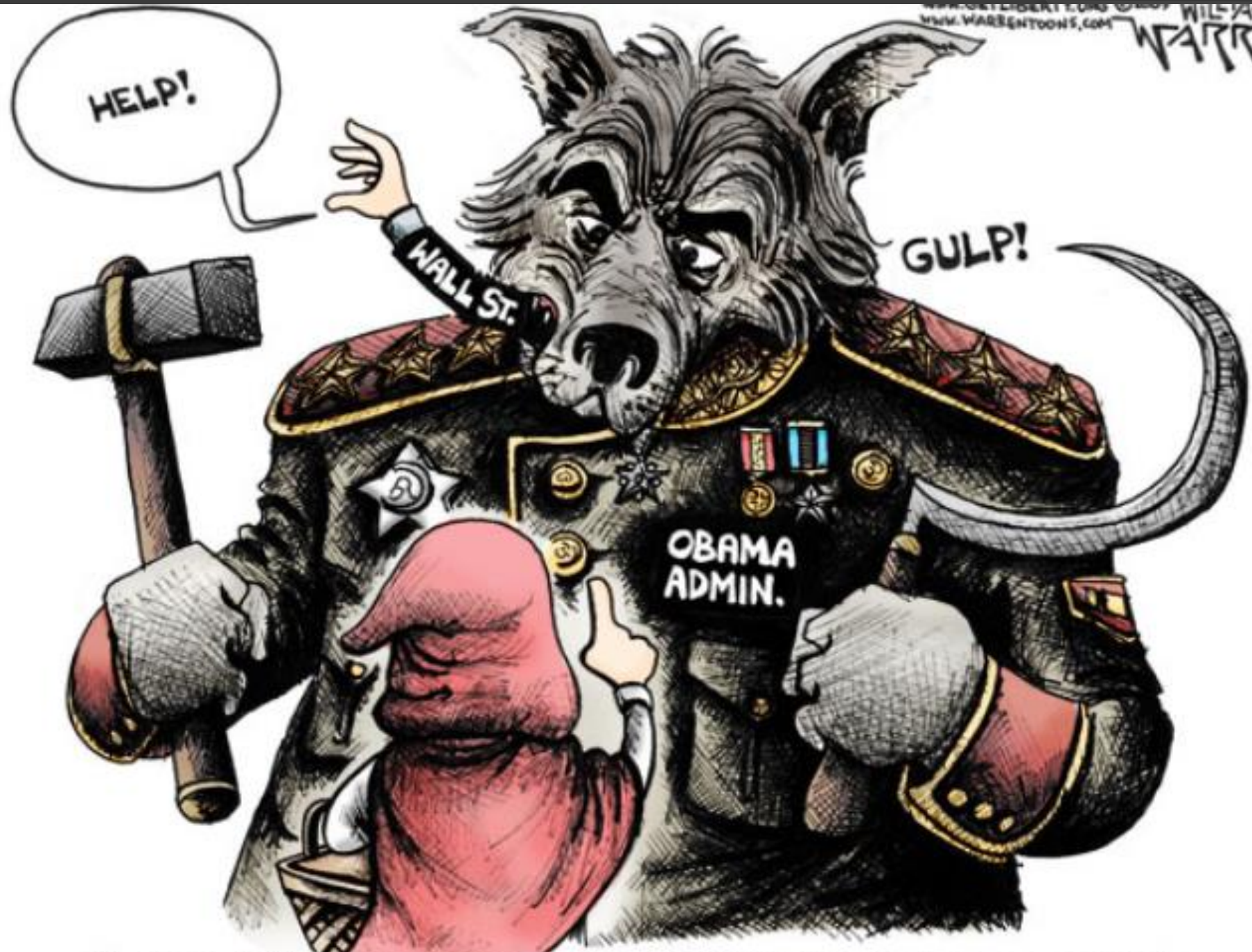
“...AND AMERICA, WHAT BIG GOVERNMENT YOU HAVE!”