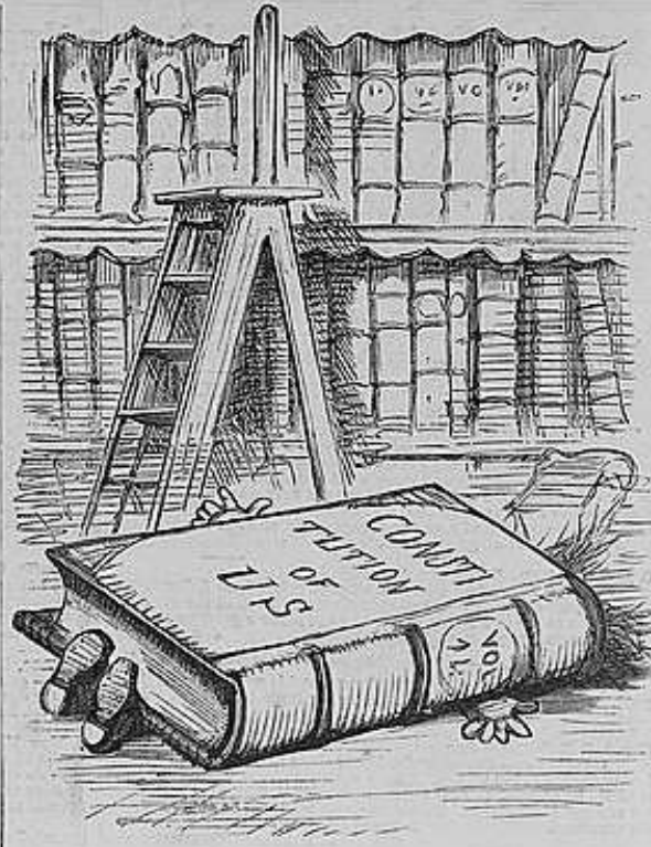
AND THIS WAS THE DISASTROUS RESULT.