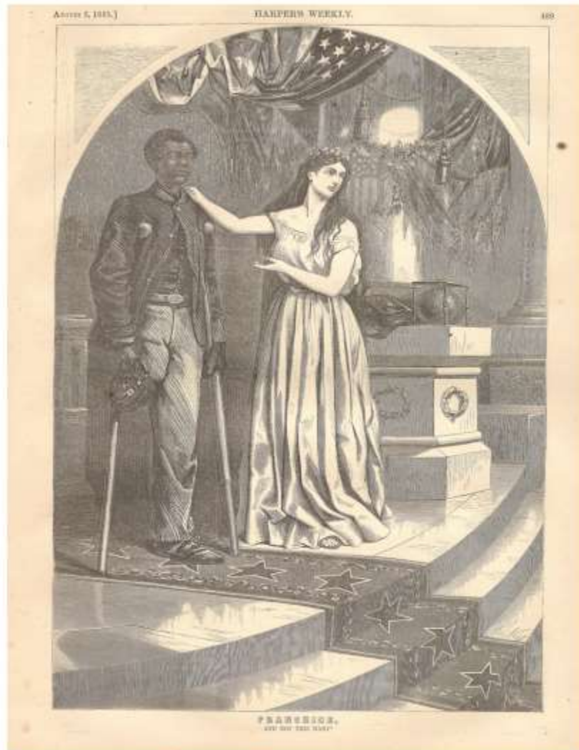
Caption: FRANCHISE. AND NOT THIS MAN?