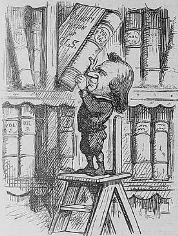
THIS LITTLE BOY WOULD PERSIST IN HANDLING BOOKS ABOVE HIS CAPACITY.