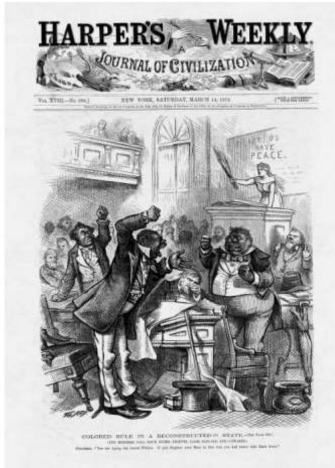
Caption: COLORED RULE IN A RECONSTRUCTED (?) STATE. (The members call each other thieves, liars, rascals, and cowards.) COLUMBIA: "You are aping the lowest Whites. If you disgrace your race in this way you had better take back seats."