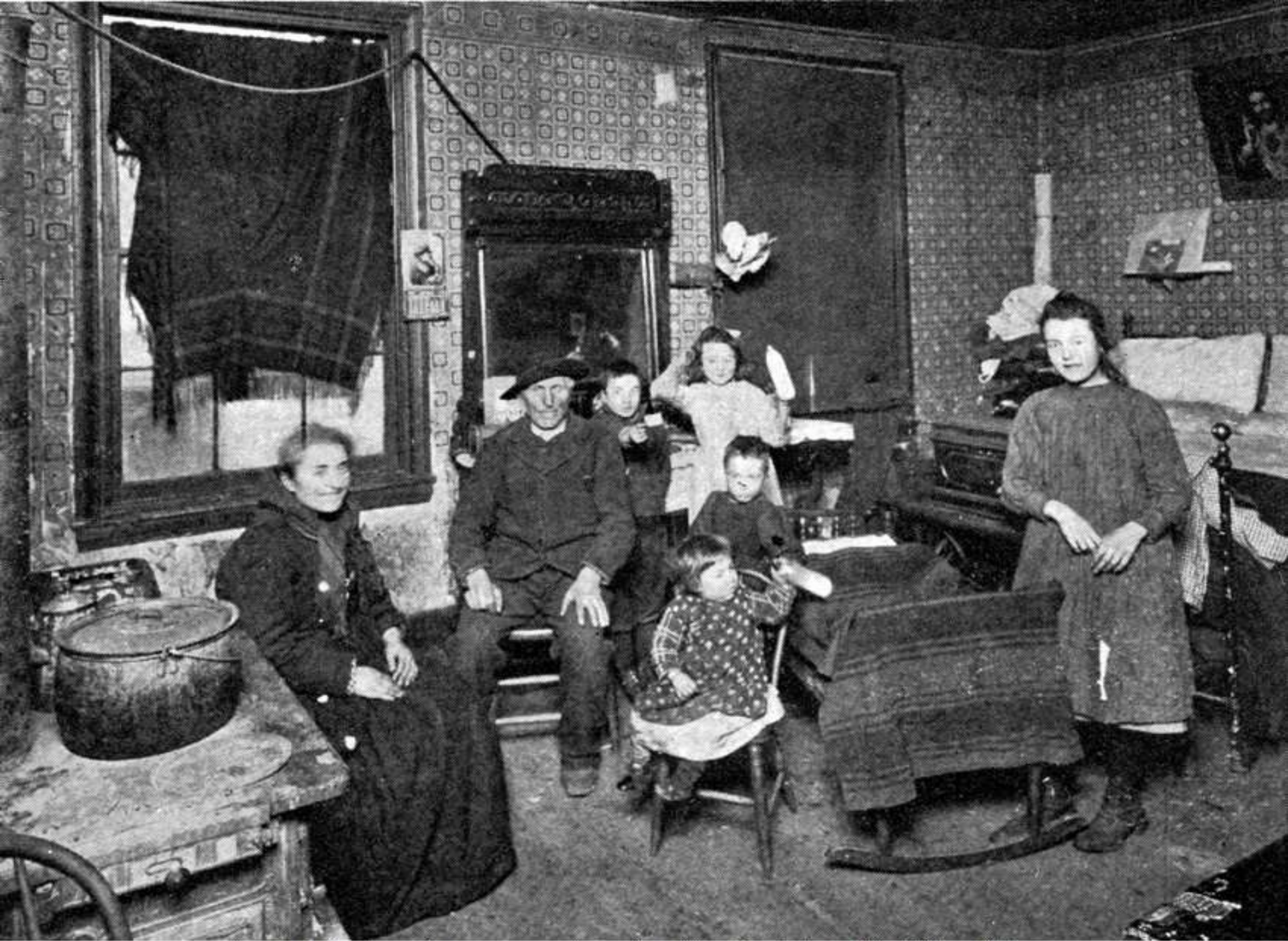
A family of seven in a one room apartment, Starr Centre Association of Philadelphia, c 1910