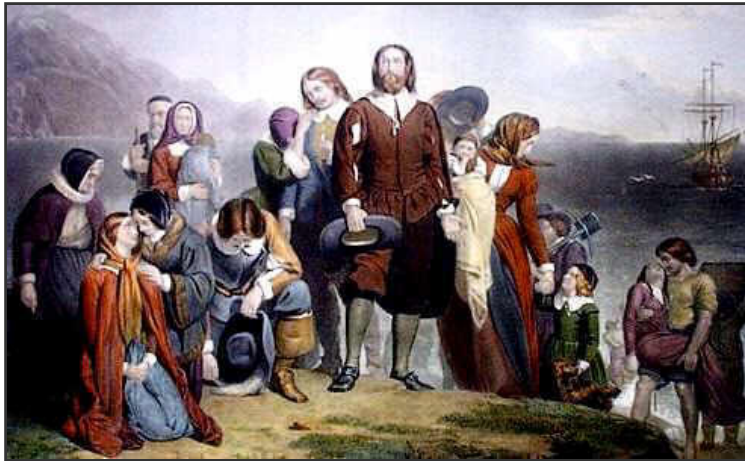
The 13 Colonies Chart - Puritan Colonists

This article provides a 13 Colonies Chart providing facts and information at a glance in respect of: